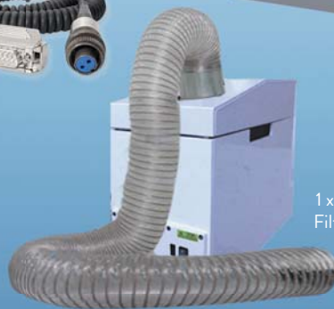
1 x Purge Fan Filter Module