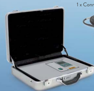
1 x Electronic Control Case